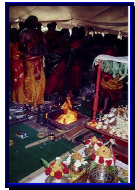
Purnahuthi During the omam at the Peetam

THE JOURNAL OF THE SRI RAJARAJESWARI PEETAM, RUSH. N.Y